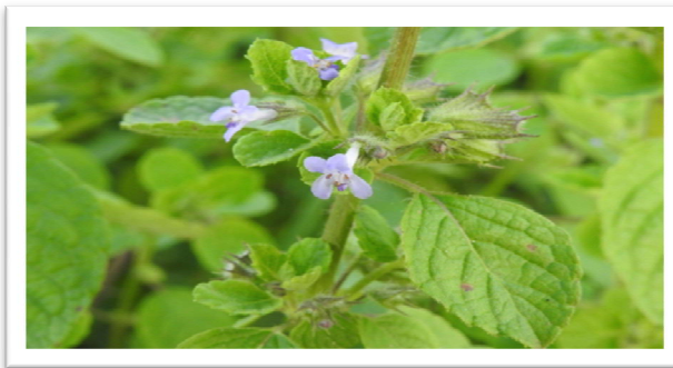
4. Hyptis suaveolens