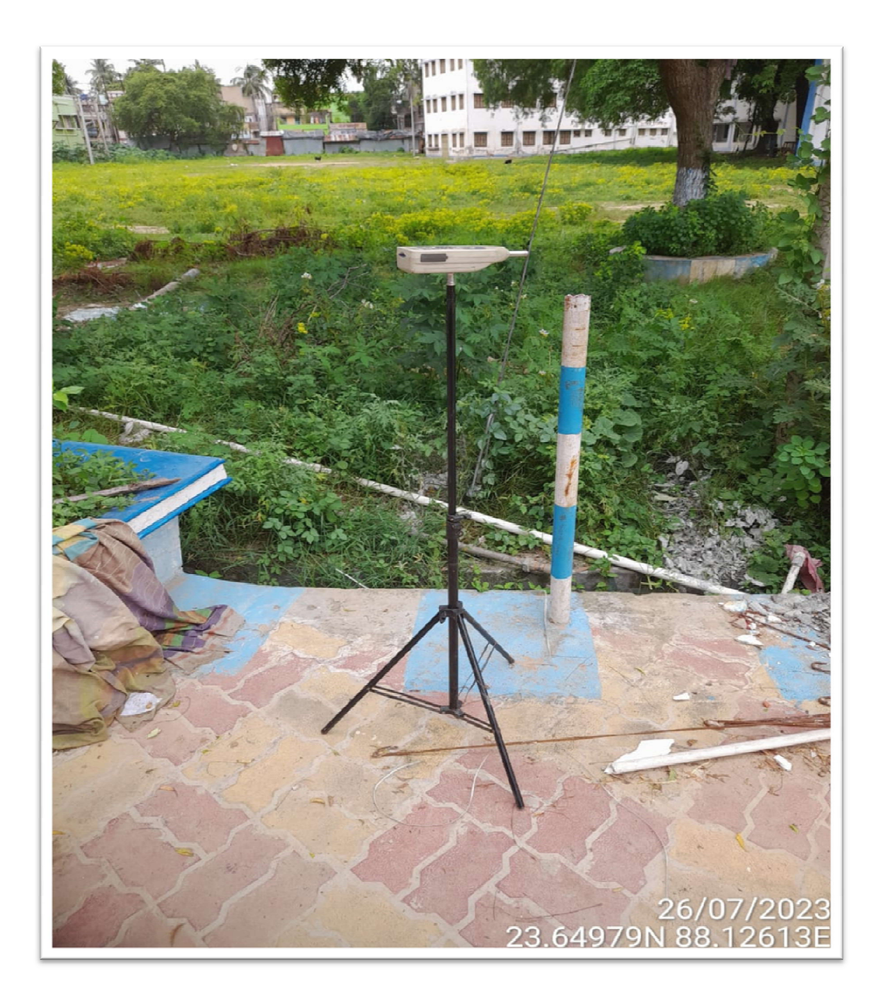
Fig. 4 : Noise level monitoring