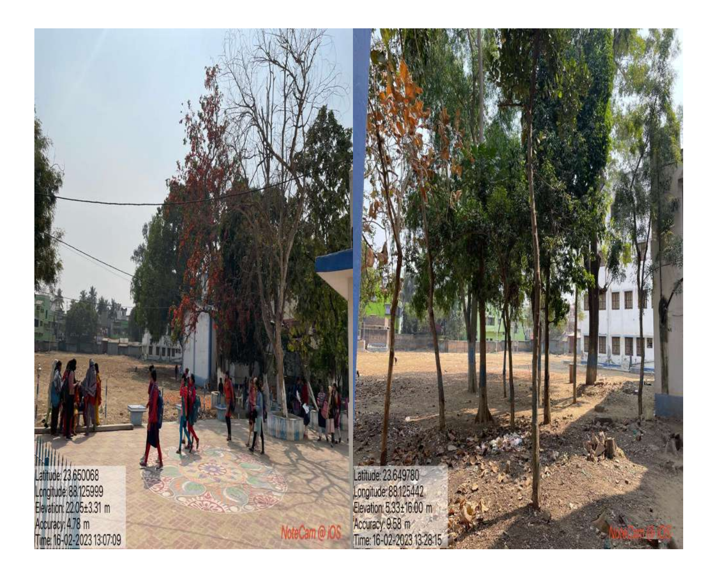
Fig. 8 : Major plant in the campus area