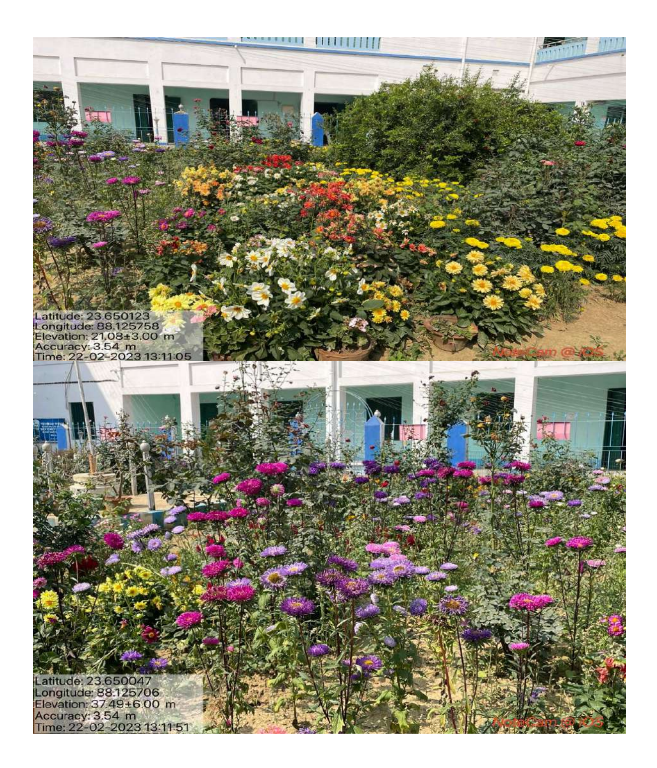
Fig. 13 : Flower of the college premises