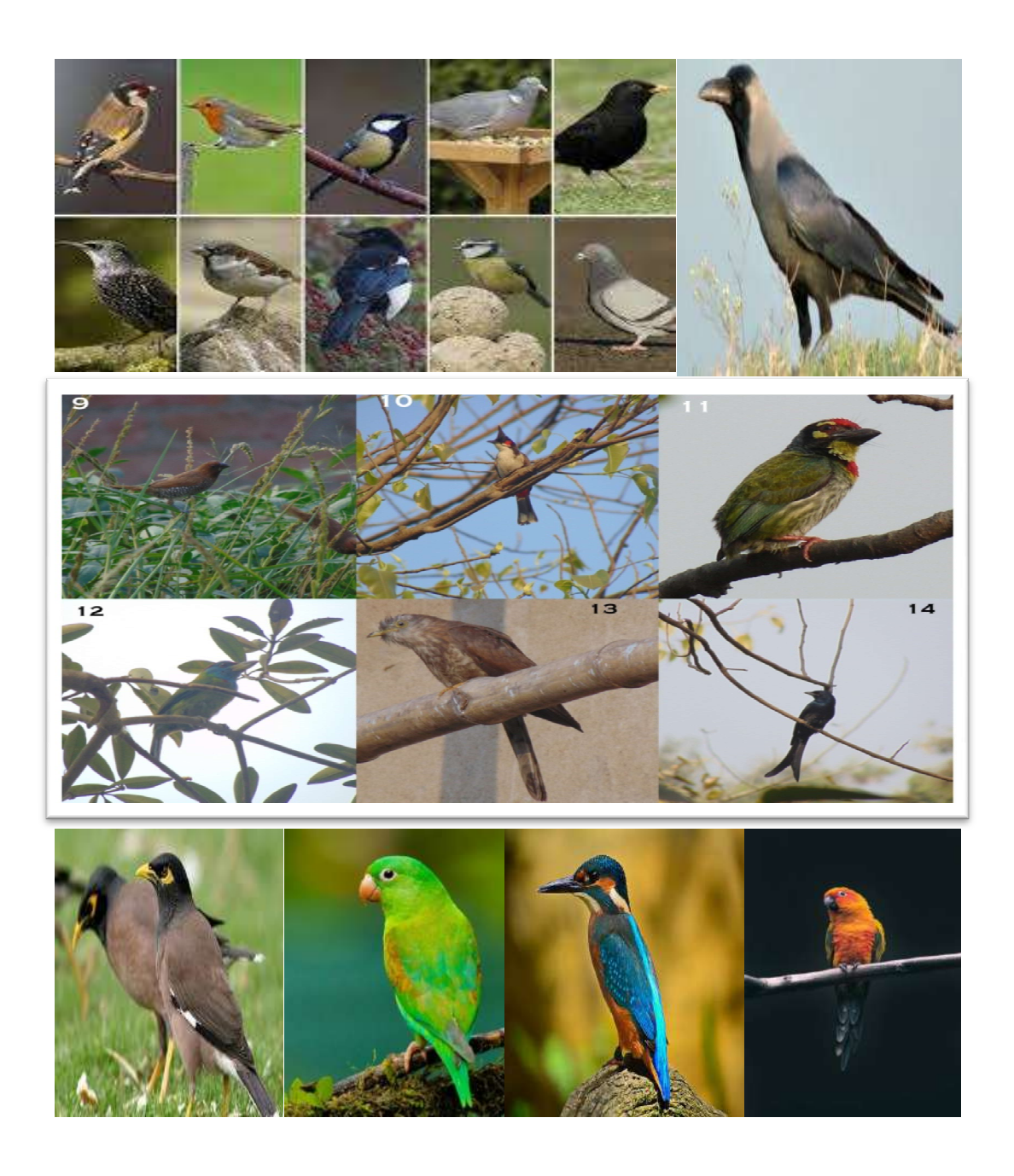
Fig. 11 : Local Birds