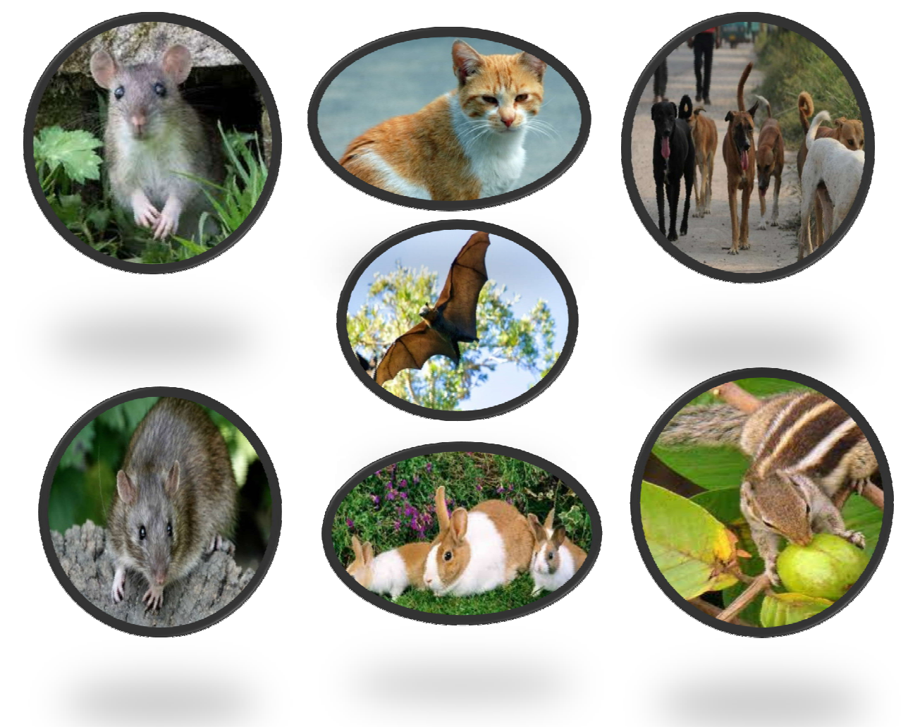
Fig. 12 : Mammals