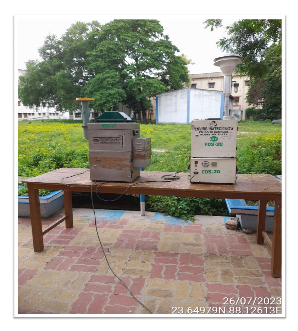
Fig. 3 : Ambient Air sample collect