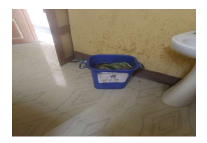
Fig. 5 : Solid Waste

Katwa College has set up separate bins to ensure proper segregation and collection of the biodegradable, non-biodegradable and hazarders waste products generated in the campus. The responsibility of recyclable waste is however still not taken up due to devoid of recycling device to carry on the procedure. However, several solid wastes such as glass, cans, which and brown papers, batteries, print cartridges, cardboard, furniture, damage pen, carbon papers etc are either sold to vendors for recycling or despatch via municipality disposal van in regular basis. The biodegradable waste such as humas, rest portion of vegetables etc. which are used in college canteen, Staff quarters and Boys' and Girls' hostels are used for preparing bio fertilizers.