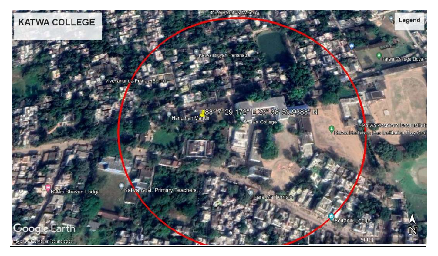
Fig. 7 : Location map