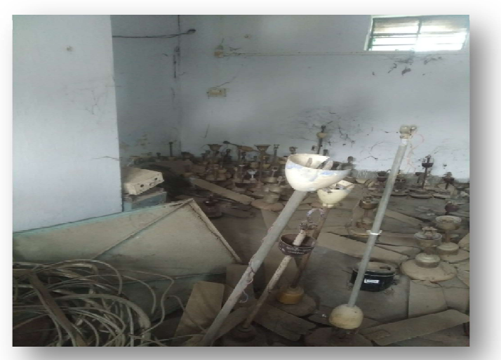
Fig. 6 : Solid Waste

It is hope that the institution will take steps to do this very soon.