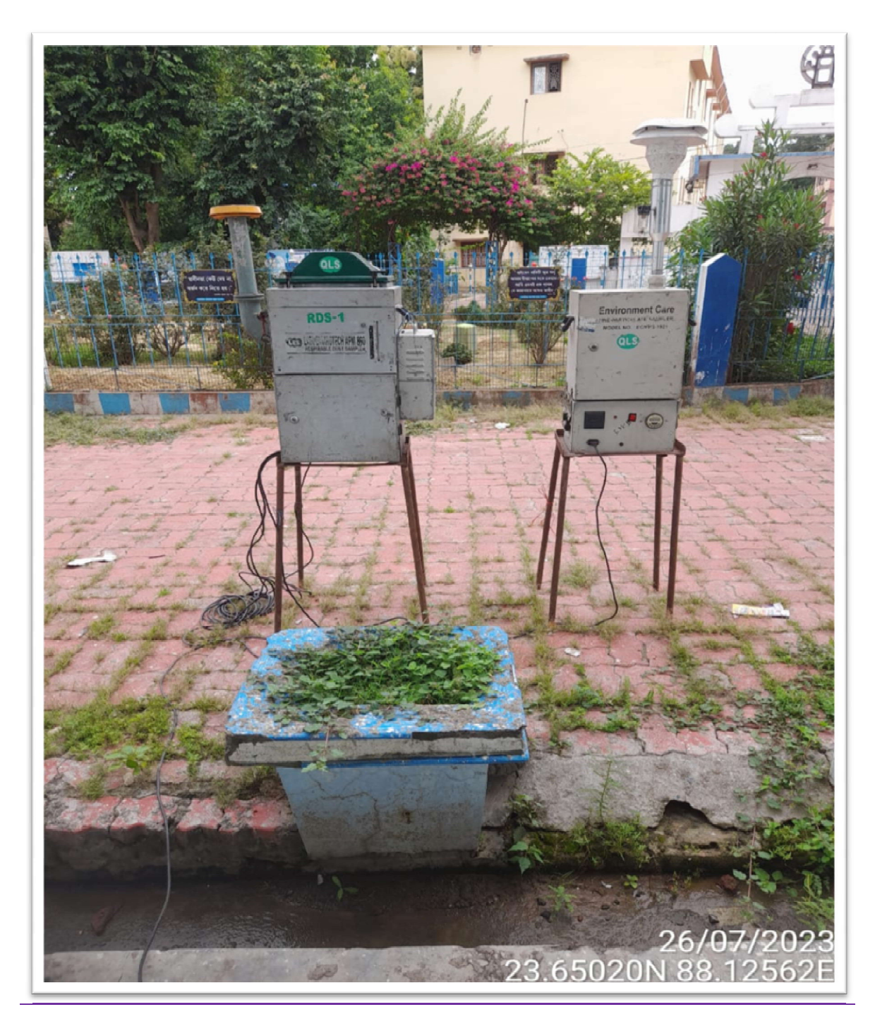
Fig. 2 : Ambient Air sample collect