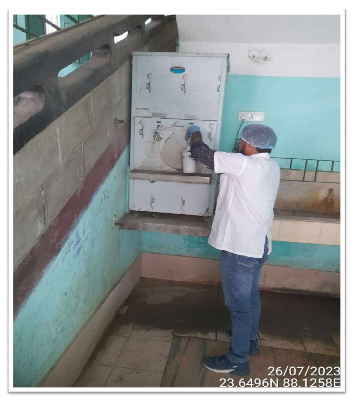
Fig. 1 : Drinking water sample collect